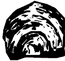
Obsidian No crystals- glassy Very quick cooling Extrusive