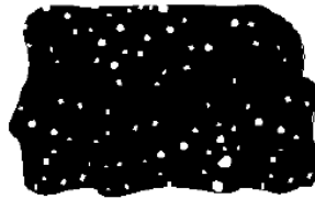
Basalt Small crystals Quick cooling Extrusive